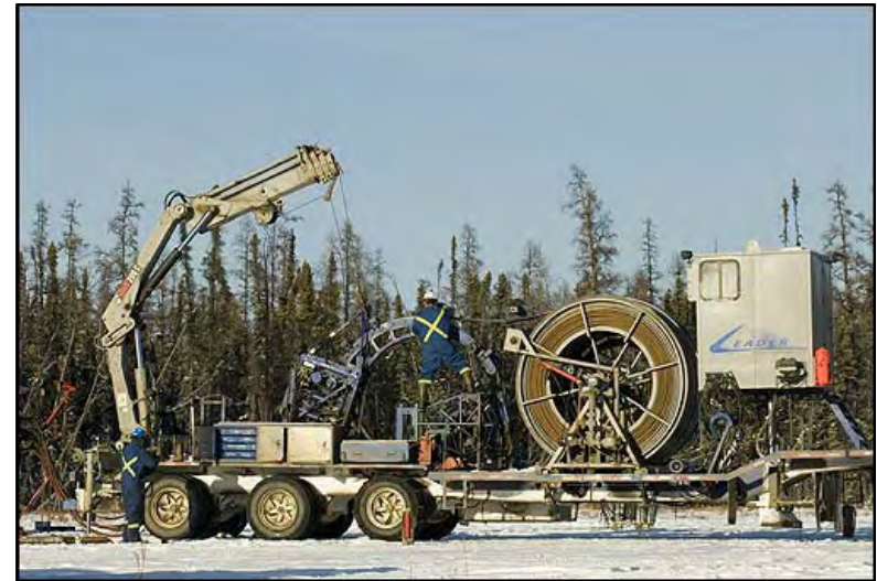
Intermediate depth coiled tubing unit