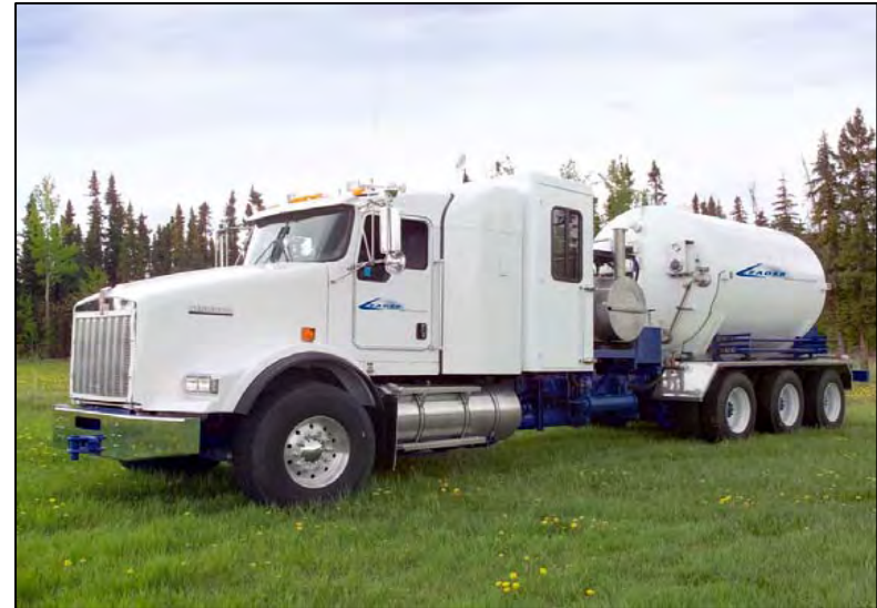
Bodyload nitrogen pumper