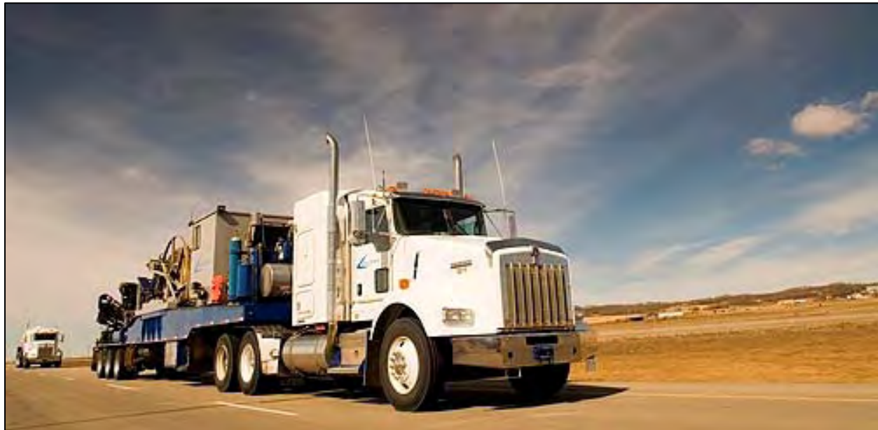
Deep coiled tubing unit