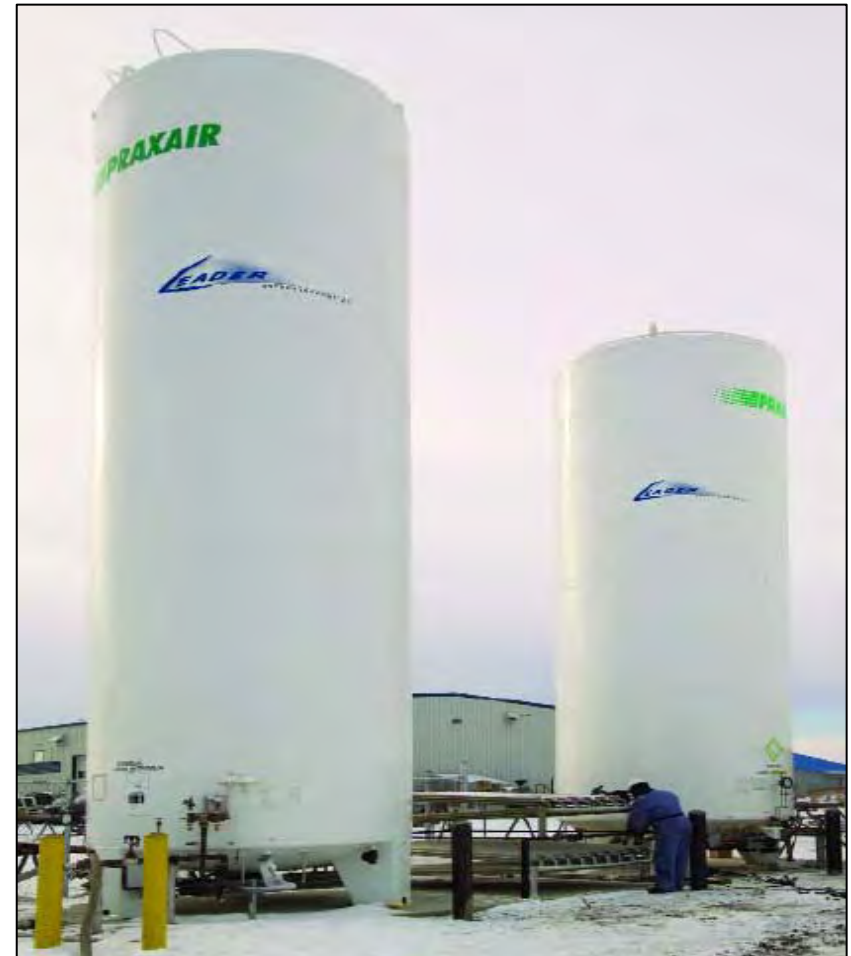
N2 Bulk Storage Facilities