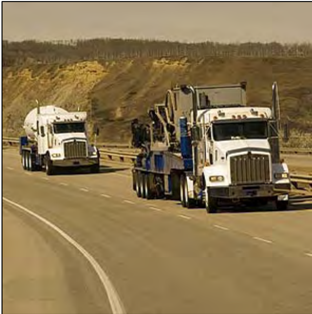
Coiled tubing and N2 pumper (Canada)