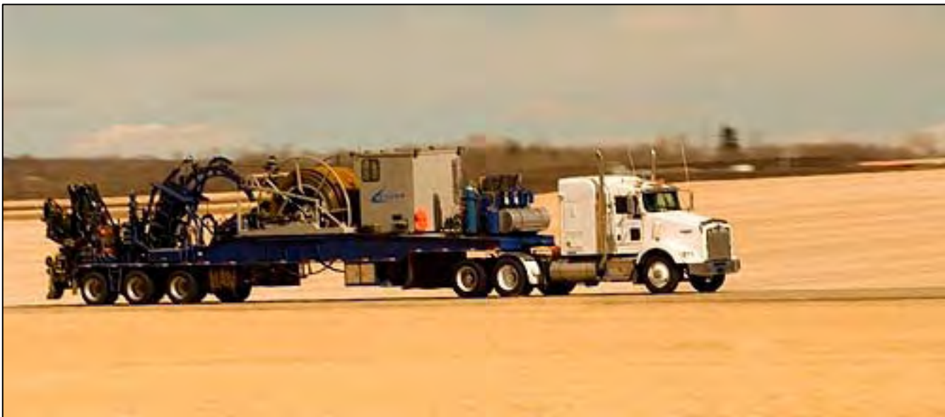
Deep coiled tubing unit