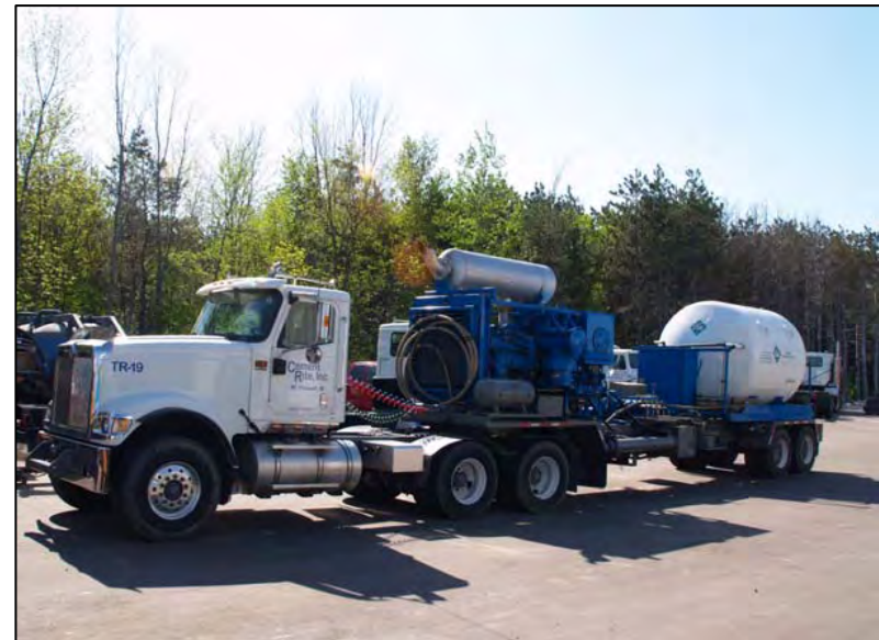
N2 pumper (Michigan)